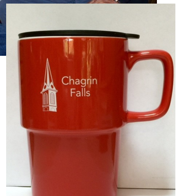
Our Primetime mugs make great holiday gifts!