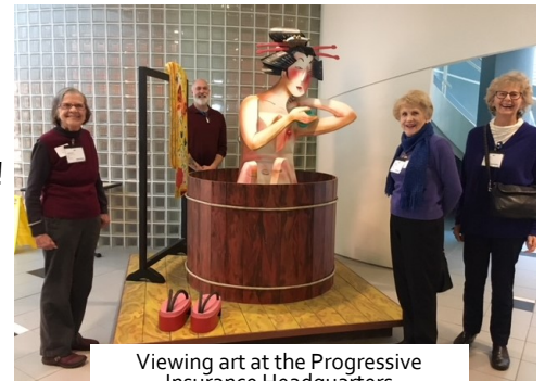
Viewing art at the Progressive Insurance Headquarters