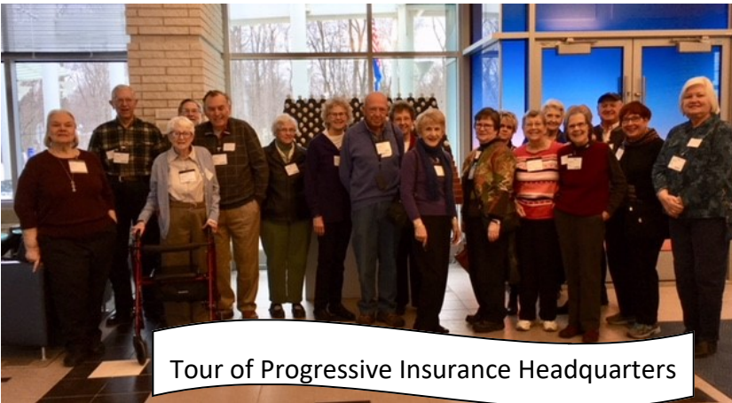
Tour of Progressive Insurance Headquarters