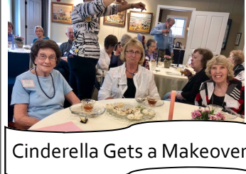
May Fed Forum