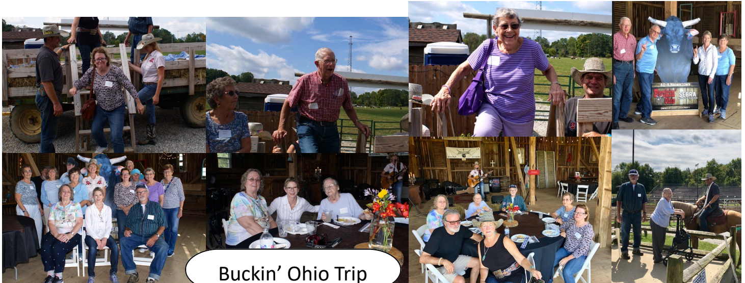
Buckin' Ohio Trip