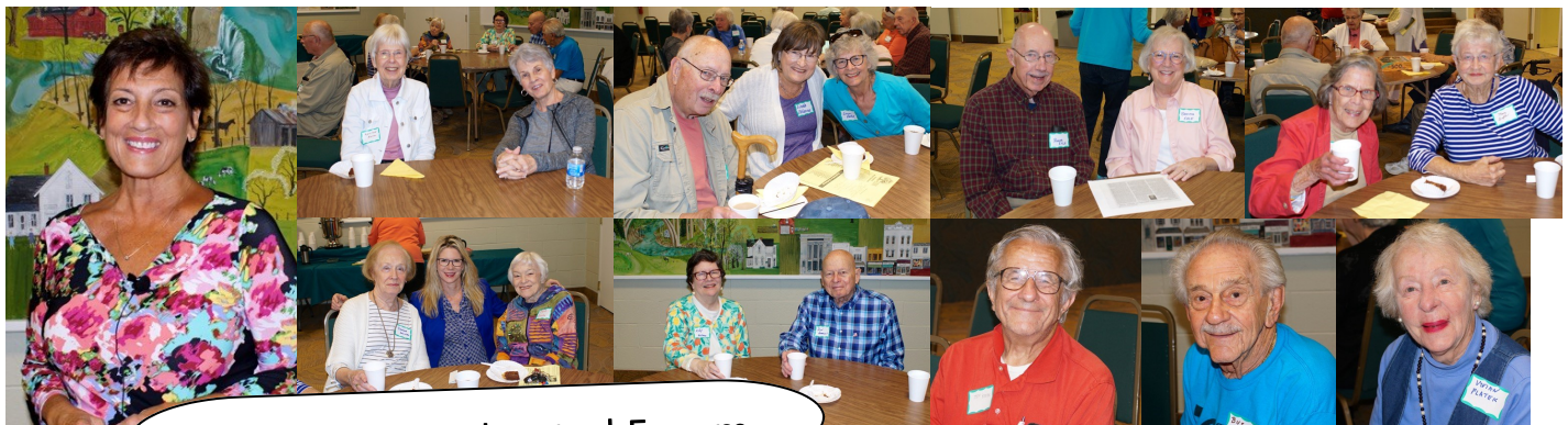
September Federated Forum