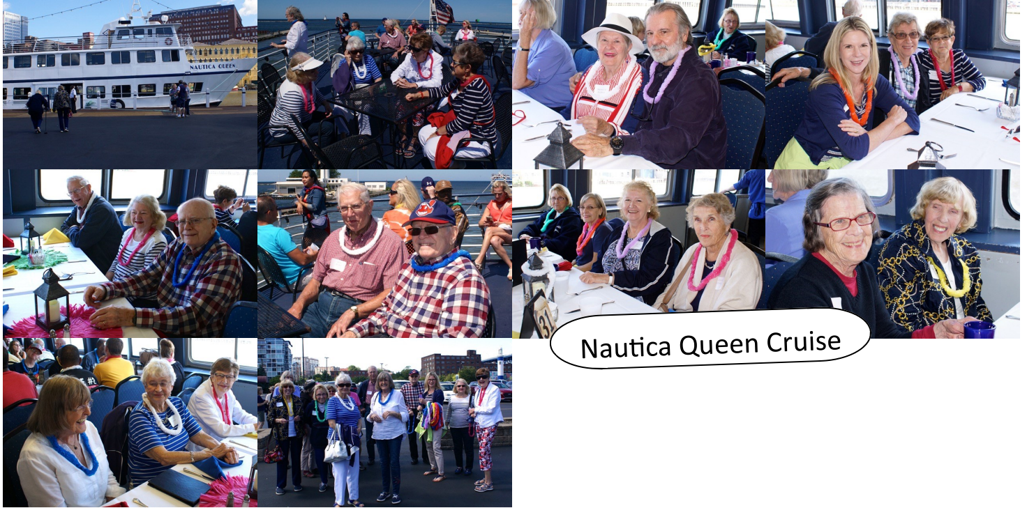
Nautica Queen Cruise