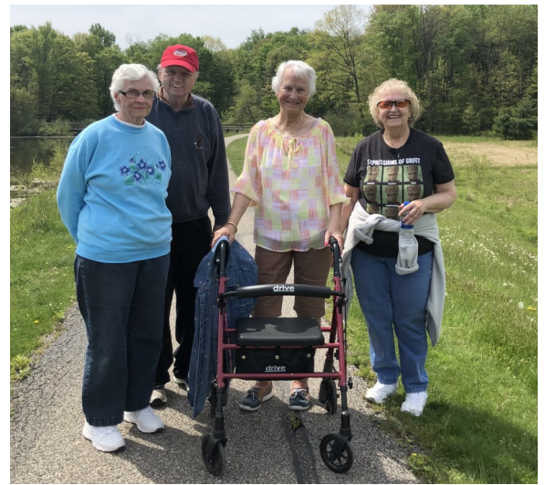
Walk at Beartown Lakes