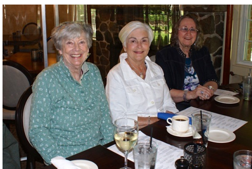
Lunch Out at Welshfield Inn